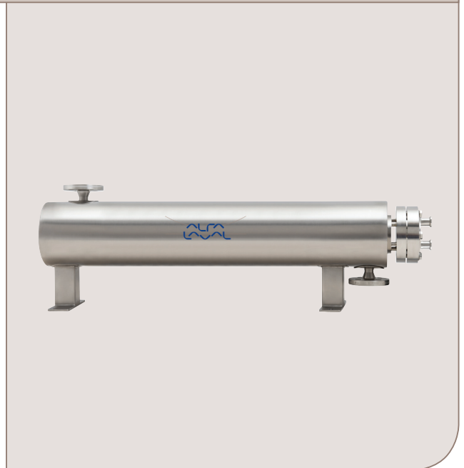
Fig. 1. Double tube sheets prevent cross contamination between the product and the heating/cooling medium.